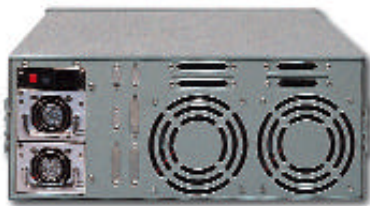
▲ RDA-209 with redundant PSU