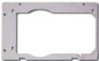
▲ Power supply bracket