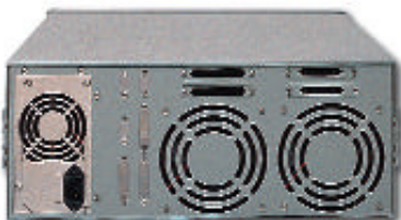
▲ RDA-209 with PS/2 PSU