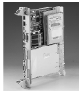
The MIC-3365 with on-board HDD and FDD

The MIC-3365 is designed for use in mission critical applications. It accepts a CompactFlash memory card on the rear transition board, thus eliminating the need to use a fragile rotating hard drive. A watchdog timer can automatically reset the system or generate an interrupt if the system stops due to a program bug or EMI. The two-layer front panel design complies with IEEE 1101.10. Connectors are firmly screwed to the front panel, and the replaceable shielding gasket is attached to the panel edge. This reduces emissions and gives better protection against external interference.