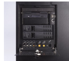
One slim CD-ROM drive, two 3.5" disk drives and two mobile SATA HDD trays