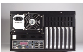
Bottom view of IPC-7143