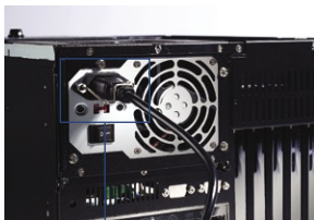
Plug ring-lock securely fastens the power cord (PS-400ATX-ZB)