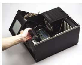
Power supply bracket with hinges