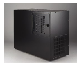
Bi-directional wall-mountable design