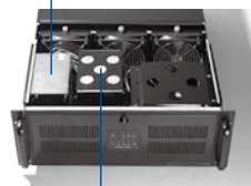
Extra drive bay which can hold up to three 3.5" HDDs