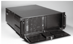
Front panel appearance while with single power supply configuration