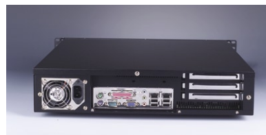
300 W ATX PFC P/S & rear panel of motherboard version